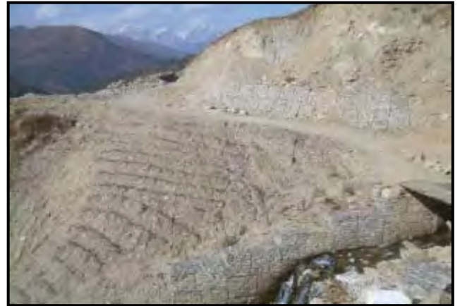
Bio-engineering works at Okhaldhunga