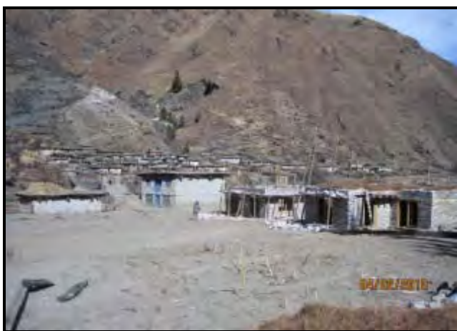
New market center at Dillichaur in Jumla district