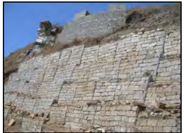
Gabion wall construction in Okhaldhunga