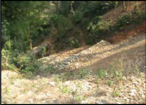
Toe wall to check spoil disposal in Ramechhap