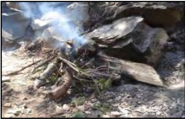
Stone breaking through the wood firing at Humla