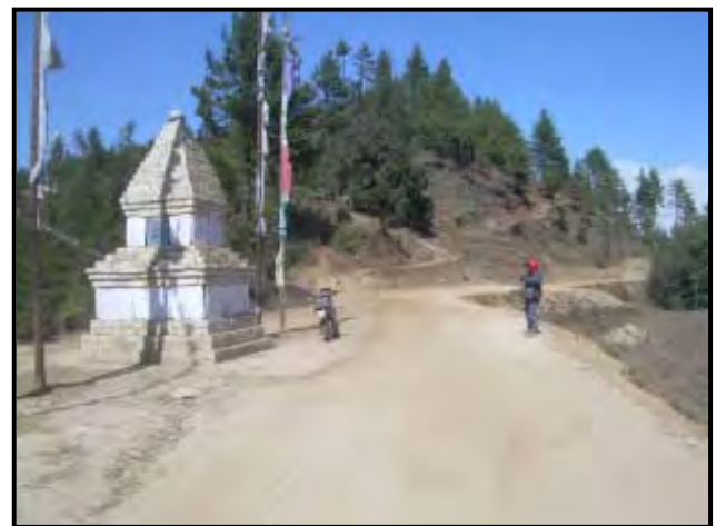
Mane after road construction (Solukhumbhu)