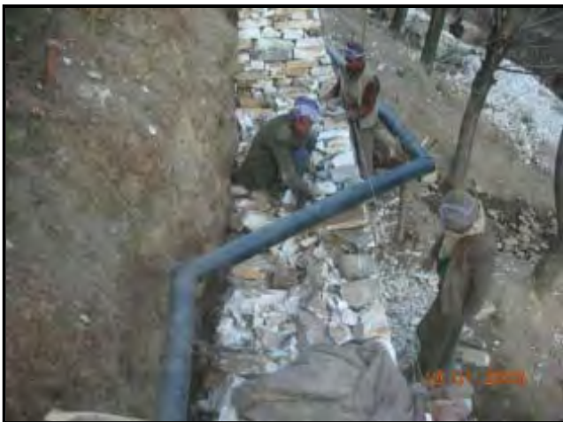
Rehabilitation of drinking water pipeline