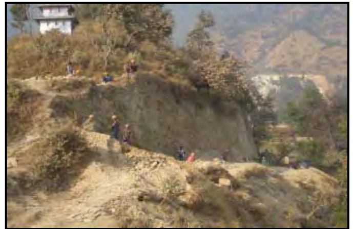
Workers are using helmets during stone cutting