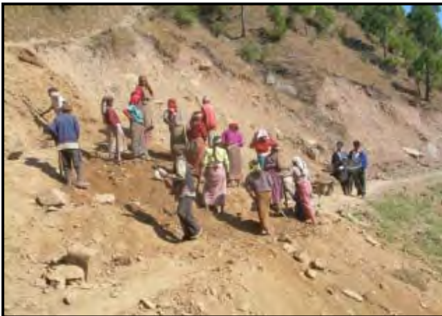
Women working in road construction