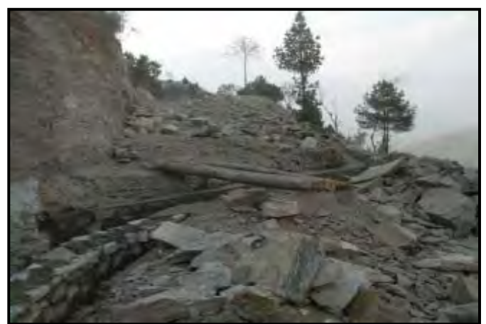
Rehabilitation of irrigation canal at Solukhumbu