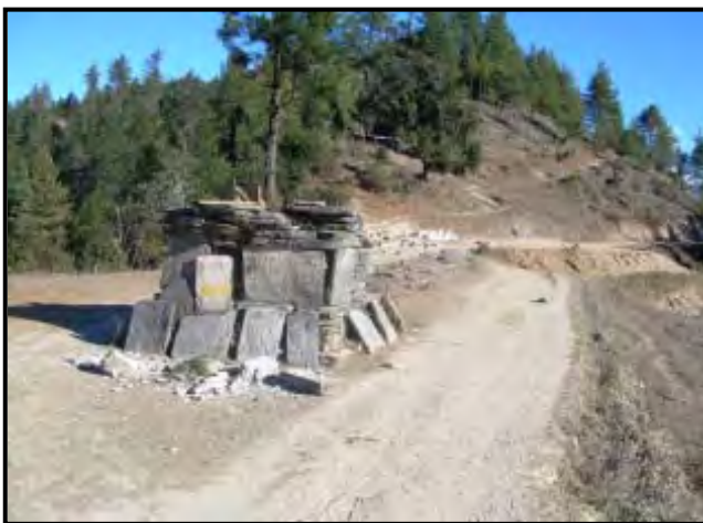
Mane before road construction (Solukhumbhu)