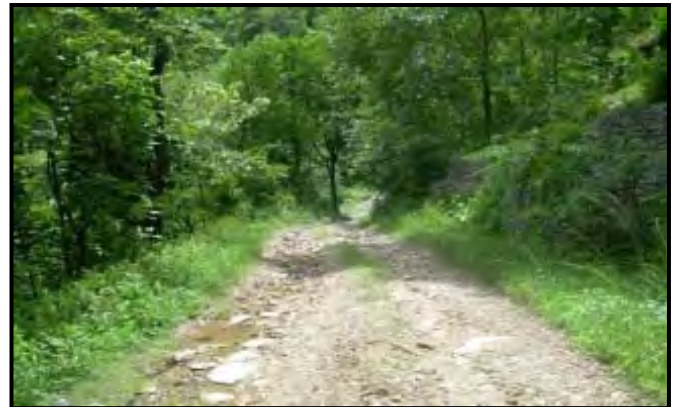
Forest along the road alignment at Baglung