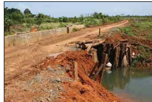
KSF-APs include assessments of verified existing data and new data

social infrastructure, livelihoods, agronomy, environment, economics, fisheries and aquaculture, agriculture, community development/ participation, hydrology and engineering. Spatial information is gathered and consolidated using the latest technology by a team of specialists in GIS and mapping. The information is then verified and assessed with stakeholders.