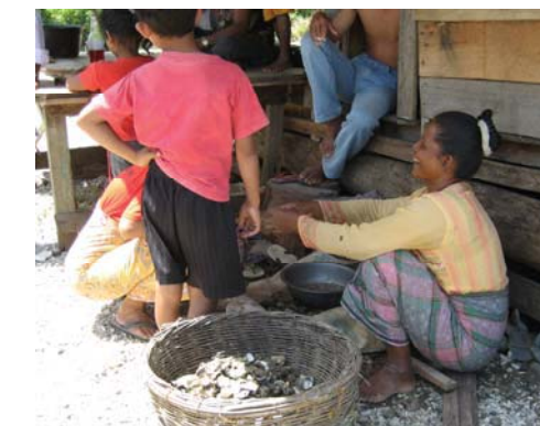
ETESP-24 is a continuation Gol's and ADB's cooperation to fight poverty and build sustainable development.

The project reflects the Millennium Development Goals and is consistent with Government of Indonesia (Gol) regulations. ETESP-24 is part of a suite of ADB sponsored projects aimed at supporting Gol's Rehabilitation and Reconstruction efforts. They reflect ADB's aim to improve the welfare and quality of life of people in Asia and Pacific and, to help its member countries reduce poverty.