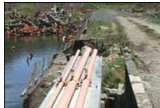
KSF-APs help to better target and coordinate projects.