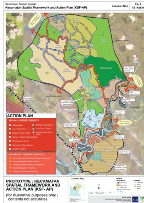
KSF-APs provide a comprehensive overview and analysis of factors in a sub district that impact on development. ETESP-24 is based on a process developed on a previous ETESP project, Package 6.

assess their costs, social and environmental considerations plus, recommend actions and projects.