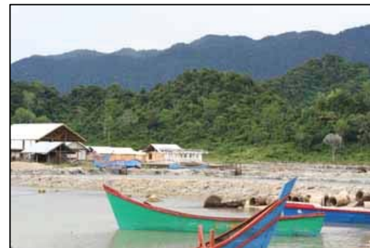
KSF-APs identify needs and priorities in livelihoods and local economies, social and physical infrastructures, plus, environment and natural resources.