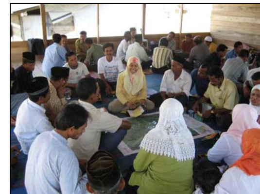
The ETESP-24 SPEM process involves verifying data in the field, consulting with local agencies and government plus, local leaders and communities for their inputs and feedback.

A : The project's KSF-APs provide a guide for better coordinated and targeted spacial planning by Gol and its development partners. The documents include maps visualizing the characteristics of a sub-district which need to be considered for effective spatial planning, environmental management and project planning. This comprehensive approach will contribute to viable, sustainable development plus, minimize waste and negative impacts on the environment, communities and future development planning.