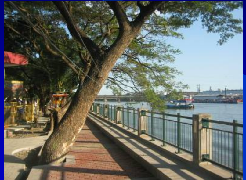
PUP Linear Park