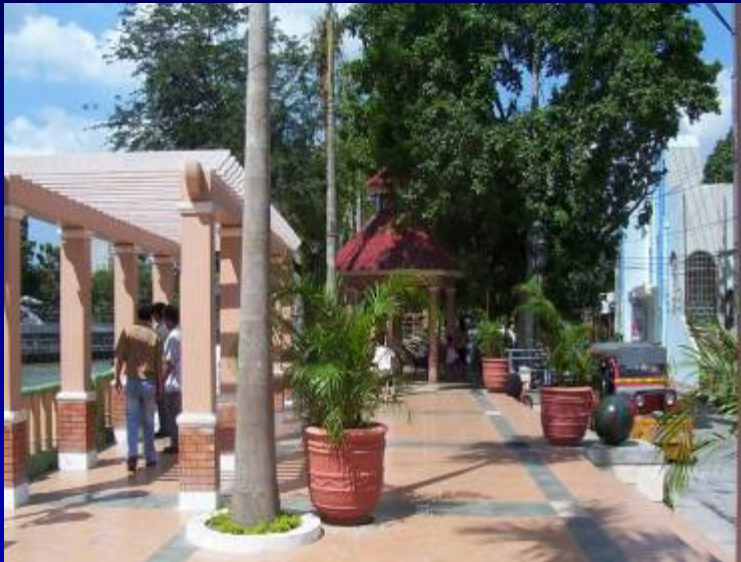
Hulo Linear Park Mandaluyong City