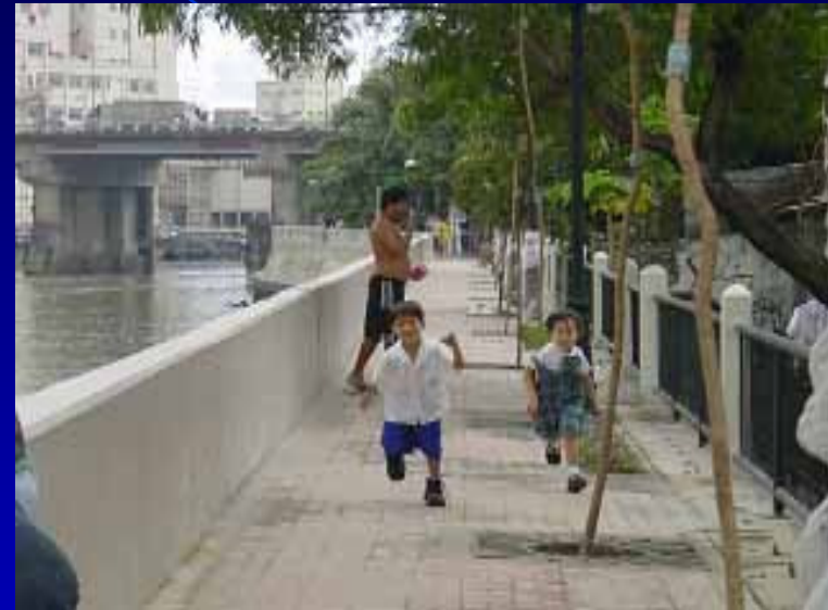
West Rembo Linear Park Pasig City